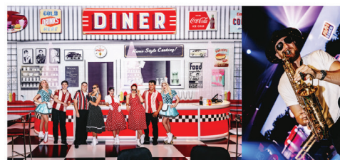
JWH BALL, CROWN BALLROOMS