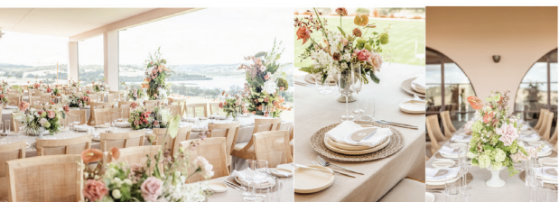
LUXE PRIVATE EVENT, PRIVATE ESTATE CHITTERING