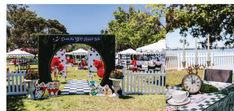
YPO, MAD HATTERS TEA PARTY, MATILDA BAY