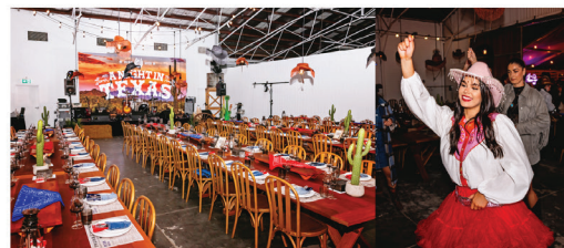
YPO HANDOVER DINNER, A NIGHT IN TEXAS

TO VIEW MORE WORK VISIT @THEPINKTANKCREATIVE ON INSTAGRAM