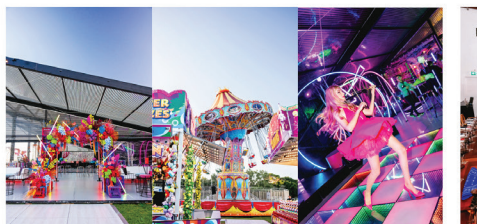
LUXE PRIVATE EVENT, NEDLANDS YACHT CLUB