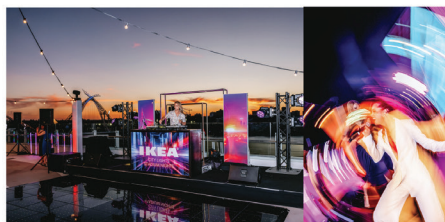
IKEA, EOY FUNCTION, OPTUS STADIUM