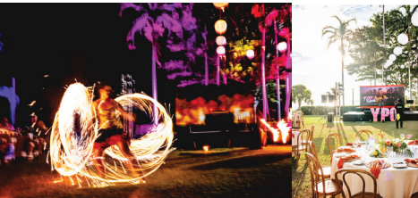
YPO RETREAT, DARWIN NT