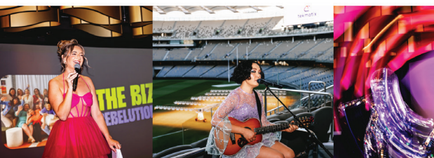
THE BIZ REBELUTION GALA, OPTUS STADIUM